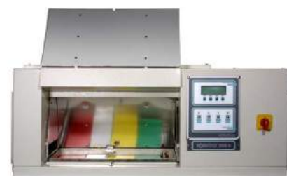
Solarbox Table top xenon testers 4 Models

We reserve the right to make changes to equipment and systems in response to advances in technology and modify parameter values accordingly.