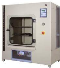
Vertical and Horizontal Salt spray chambers, 8 Models Full range of options for continuous and cycling test.