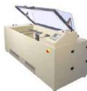
Horizontal Salt spray chambers.