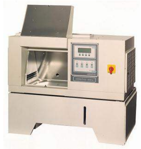
SOLARBOX 1500 E with FLOODING

PVC and corrosion-resistant materials ensure long life of this tank pump system: capacity up to 50 litres.