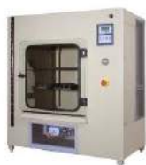
Vertical Salt spray chambers.