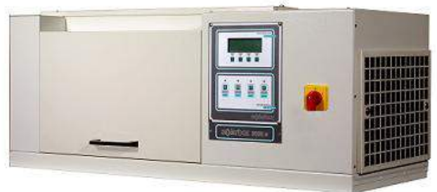
SOLARBOX 3000 E

Consequently, because the temperature produces an accelerated ageing, it is essential to be able to control of B.S.T. during exposure to filtered Xenon radiation.