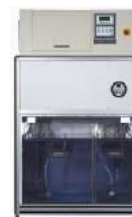
SOLARBOX R.H. with Humidity Control

We reserve the right to make changes to equipment and systems in response to advances in technology and modify parameter values accordingly.