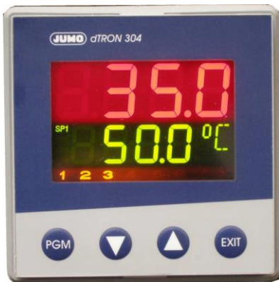
Figure 1 JUMO controller